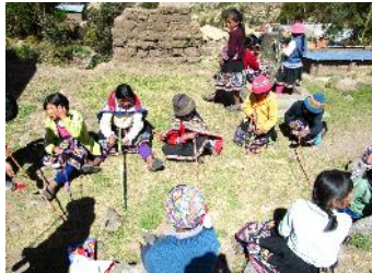
Children participating in artisan program

learned the value of their new found skill, as they are often visited by tourists who purchase their creations, providing some economic benefits.