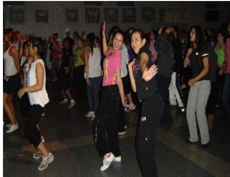
Getting Down at Zumba Night

In March, LAFONTAINE hosted their annual fashion show in aid of CAFE, showing the latest styles for 2012. Many thanks to the ladies at LAFONTAINE for