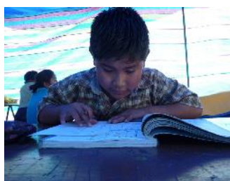
Young student reading at the mobile library