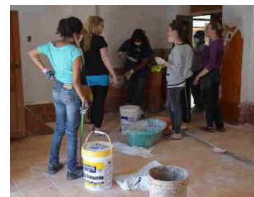
Learning for Hope students helping at the centre in Cusco

centre as it grows to serve the girls of Cusco.