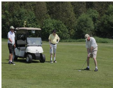
CAFE Golf Tourney. Four!