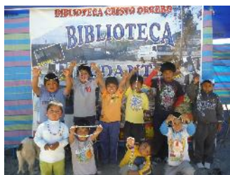
Children showing off their creations