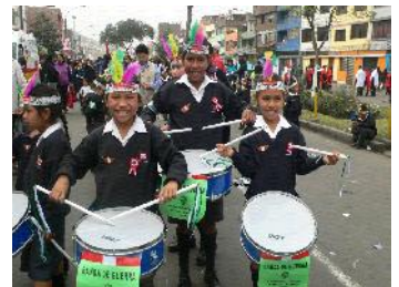
Kids from music program performing in Peruvian Independence Day Parade

Maybe one day, a student from Canta Gallo will be the next big cumbia sensation.