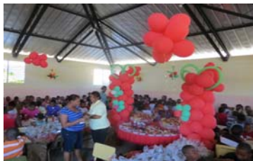
Christmas gathering in new building

and they were able to celebrate both the new building and their Christmas gathering.