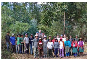
Learning for Hope group with community members in Cusco

This July, a group of Learning for Hope community members traveled to Peru. The group spent ten days living in the Cusco area, where they were exposed to the diversity and richness of the Andean culture and traditions. More importantly, group members had the privilege of participating in a community work project with the people of Huaran, a small town located in the Sacred Valley. By joining forces with the members of the community, we were able to