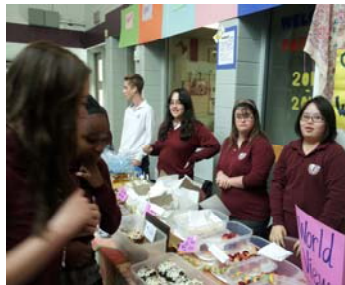
Baked goodies at the Latin Market

our high school. We first saw the need to build leadership and community within our school.