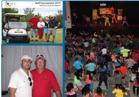
Golf and Zumba Events. Thanks to all who came out!