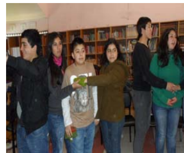
Students participating in workshop

initiatives run by SEPADE, a local organization in Concepción, Chile since 2010 when we supported efforts to help students deal with the trauma of the earthquake and tsunami that hit the area. SEPADE works mainly with high school and technical school students providing additional skills to help them make their way in the world.