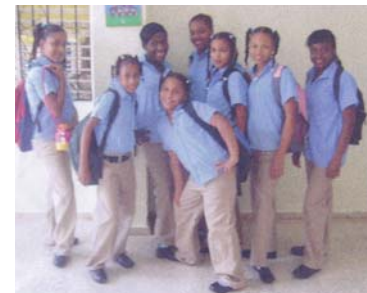
Girls from orphanage in Bani

This is an ambitious project which will develop over the years. CAFE, this year is supporting the purchase of equipment to outfit classrooms which the organization will run. Undocumented Haitian children are not allowed to attend Dominican schools and so getting the kids off the street and into a classroom is one of the most pressing issues.